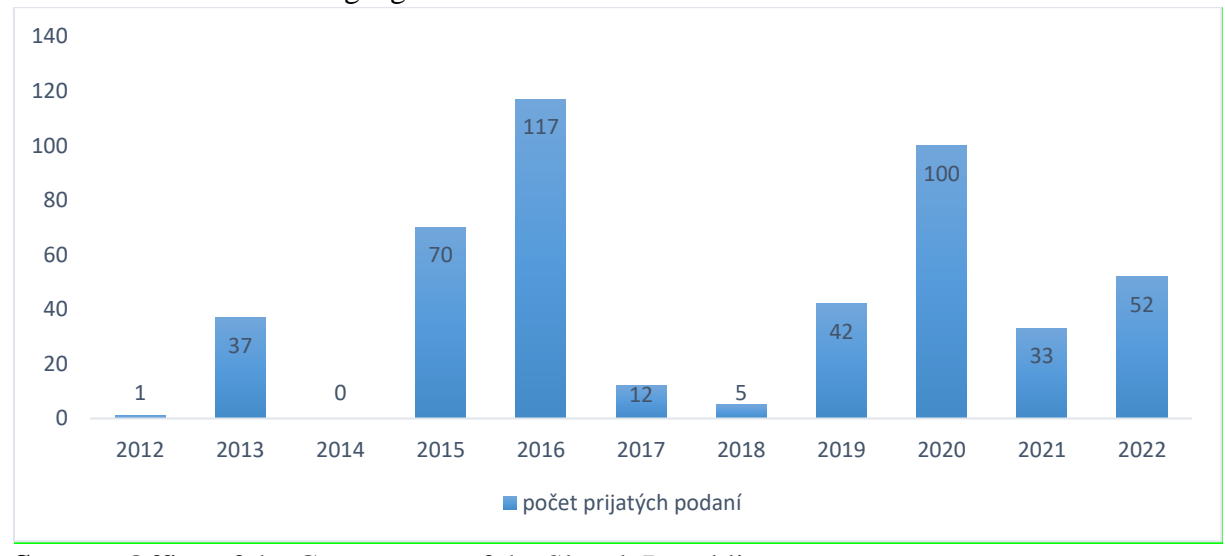
Chart 3: Overview of language submissions received from 2012 to 2022.

In the reporting period 2021 – 2022, the Plenipotentiary and their office, in cooperation with OSGSO, handled a total of 85 submissions concerning the use of the languages of national minorities related to possible violations of the provisions of Act No. 184/1999 Coll., of which 1 submission was received from a legal entity and 84 from natural persons. The majority of these submissions concerned primarily possible violations of Sec. 4(7) of Act No. 184/1999 Coll. In the period 2021 and 2022, the Office of the Plenipotentiary, in cooperation with the OSGSO, handled 73 language submissions, with a further 12 still pending resolution.